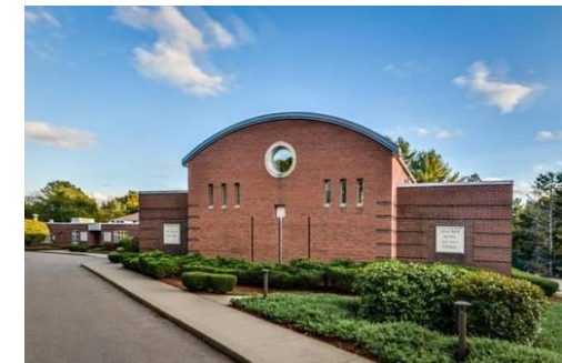
Temple Aleyah, a green synagogue