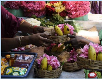
Bamboo baskets take the place of polythene bags

Fair Trade Church , a label by eco congregation Scotland, has led many Scottish churches into fairly traded choices, like Westray Parish Church, Langside Parish Church, St Margaret's Episcopal Church and Netherlee Parish Church.