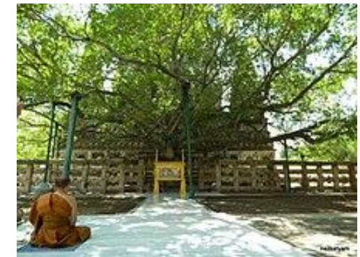
Bodhi Tree

Environmental education has been highlighted since the very beginning. And planting is usually listed in the sustainable actions by green houses of worship.