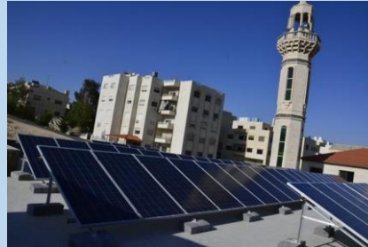
A mosque in Tabarbour

The Green Mosques Project in Jordan, backed by the Ministry of Religious Affairs and the Ministry of Environment, helped 400 Jordanian mosques equip solar panels.