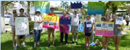
Temple Solel

Temple Solel committed to reducing its carbon footprint and populating environmental advocacy. They gained the GreenFaith Energy Shield certification in 2018.