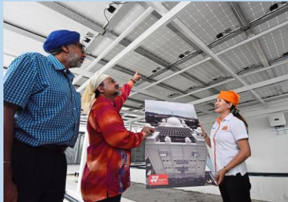
Checking solar panels on top of the gurdwara in Bayan Lepas

Solar energy is a prevailing method for sustainability among houses of