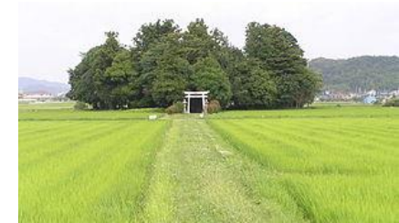
Rice paddy and woods around Kasuga Shrine in Tamba Sasayama

Sacred Forest in or around almost every Shinto Shrine is a preservation of local flora or historical trees.