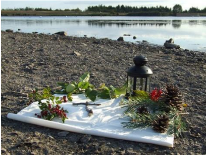
Pleasley Forest Church

Longshan Temple reduces the use of incense and find more eco-friendly alternatives for traditional incense.