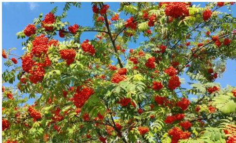
Rowan Tree