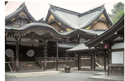
Kaguraden at Ise Jingu