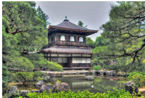
Ginkaku ji Temple

To build up green houses of worship is to have religious sites engage in eco-friendly practices of worship, sustainably design and construct buildings, and most impactfully, to act as a centre of sustainable lifestyles and teachings within communities. The engagement on green issues is a journey that unfolds gradually. What you can do depends on where you are starting from.