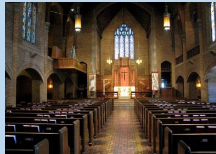
Mount Olive Lutheran Church

Mount Olive Lutheran Church in Minnesota, USA, is a pioneer in geothermal and solar technology.