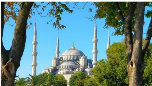
A mosque in Istanbul

All faiths teach to revere and take good care of nature and the environment. Houses of worship, churches, mosques, synagogues, temples, etc. , often serve as the spiritual centre for communities. When these focal sites preach about sustainability, believers will learn to become increasingly environmentally conscious in their daily lives. Therefore, the work done in and around the houses of worship will have great influence.