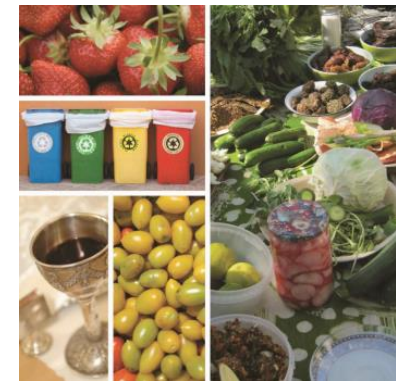
Green Kiddush

Similarly, Eco-Synagogue , a counterpart to Eco-Church, has set off to provide case studies, resources and tools for their registered members who are willing to act on greening their synagogues.