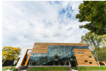
Jewish Reconstructionist Congregation, photo from its website .