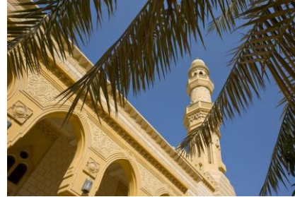
A Mosque in Abu Dhabi

that will allow to recycle water for the areas surrounding mosques.