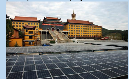
Solar Panels in Zhengjue Temple, China

Thailand, Myanmar, China, India and South Korea. These procedures reduce their energy bills, provide a more reliable source of energy, and even a steady source of long-term income by selling excess energy back to the main grid. Thus far, some 100 temples in South Korea have participated in this project.