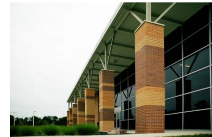
Keystone Community Church

Keystone Community Church was designed to be a green building, and it became the first LEED certified church in the USA in 2005.