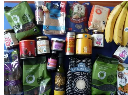
Westray Fairtrade display

Fair Trade Church , a label by eco congregation Scotland, has led many Scottish churches into fairly traded choices, like Westray Parish Church, Langside Parish Church, St Margaret's Episcopal Church and Netherlee Parish Church.