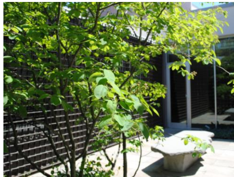
Westchester Reform Temple, a green synagogue certified by LEED

Without a doubt, greening the physical structure is also an essential step for your house of worship. Decarbonizing buildings is critical to achieve the Sustainable Developments Goals, due to the construction sector accounting for almost 40% of energy and process-related emissions. Taking climate action in buildings and construction is among the most cost-effective solutions 5 .