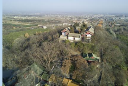
Louguantai, a sacred site in Daoism

are preventing erosion through planting.