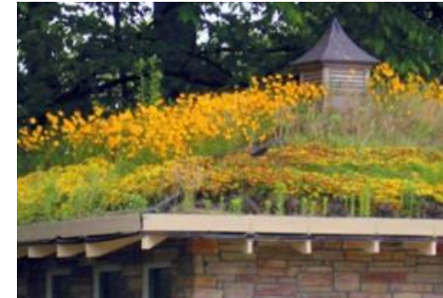
Rooftop of Annunciation Byzantine Catholic Church