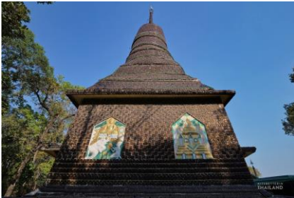
Wat Pa Maha Chedi Kaew, photo from its website .

million recycled beer bottles, shows great creativity by using non-conventional recycled materials.