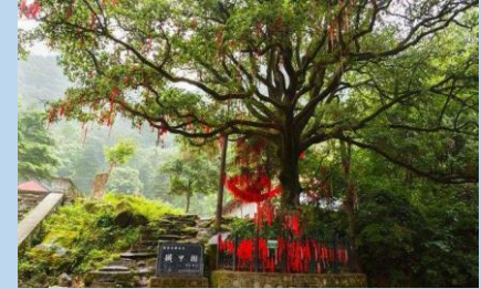
Tiejia Tree in Tiejia Eco-friendly Temple

environmental education to pilgrims and practitioners.