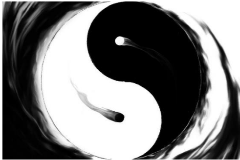
Yin Yang