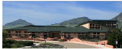
Beth David Congregation, photo from its website .

The Beth David Congregation is the first synagogue certified with LEED. Its sustainable design and materials that have minimal or no environmental impact embody the Jewish doctrine of tikkun olam , repairing the world.