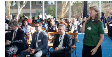
Faith for Earth Dialogue in UNEA 4, photo from UNEP .

So far, dozens of faith-based organizations have been accredited by UNEP , enabling them to directly participate in UNEA as observers.