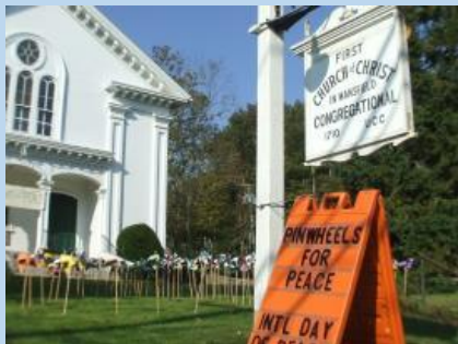
The first church of Christ in Mansfield, a member of IEJN, photo from website

Eco Church by A Rocha in UK, Green Houses of Worship programme by Interreligious Eco-Justice Network (IEJN) in US, Green Churches Network in Canada all push to emphasize their work about greening churches among their members.