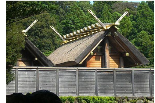
Ise Jingu Grand Shrine , rebuilt every 20 years, photo from Smithsonian

based on a Shinto tradition. The timbers, the construction materials for repairing, are all produced with the trees grown within the shrine land. People regard the rebuilding as an old solution to resilience after the eroding effects of time.